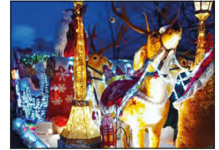
Santa Sleigh

Santa's sleigh loves touring Watchet on Christmas Eve and aims to visit as many streets as possible but this depends on accessibility for his larger and longer sleigh to safely manoeuvre through roads. This can be an annual festive challenge, especially trying to pass through a narrow streets and lots of parked cars, so please bear this in mind for parking that evening.