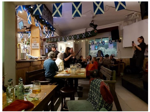
Community pub and Burns night event