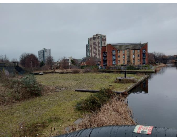
Area for new community hub